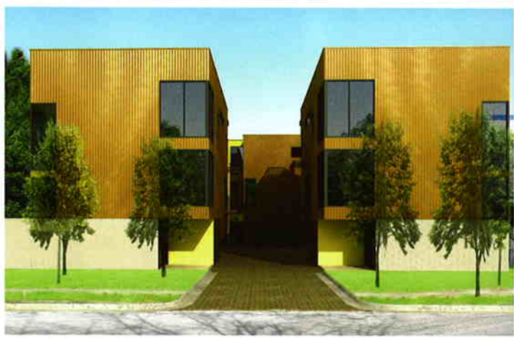
4145 Buena Vista, new construction on The Katy Trail $849,000 to $1,049,000