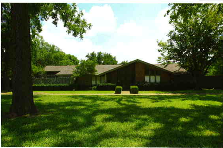
5240 Northhaven, acre+ in Preston Hollow $899,000