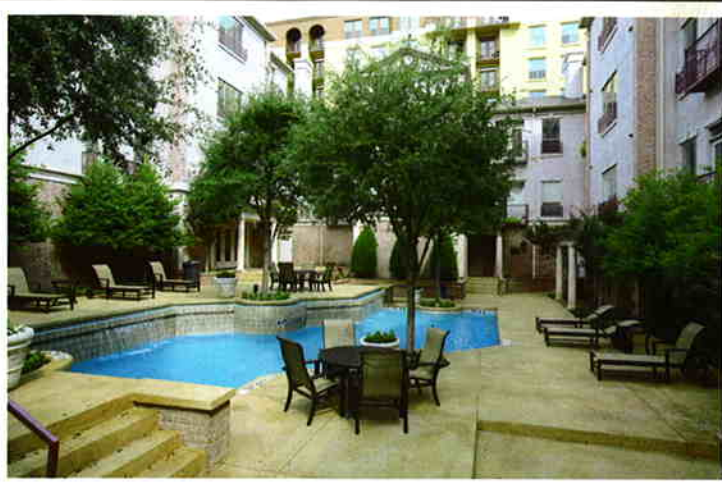
The Manor at State Thomas, 28 condominiums $355,000 to $430,000